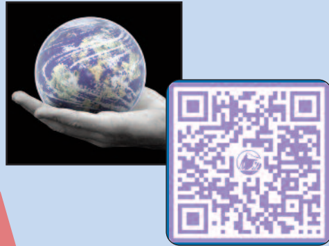
Scan to Your Future